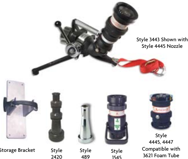
Style 3443 Shown with Style 4445 Nozzle